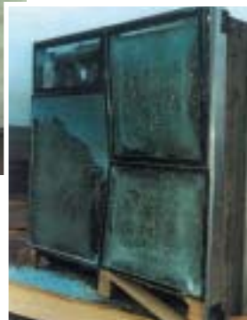
AV05124 - Photo courtesy of Grendon Design Agency

In controlled bomb-blast application testing conducted by Dow Corning, 12 kilos of TNT were exploded 6.5 meters away from a 12 x 12-meter glass curtainwall panel structurally glazed on all four sides with a Dow Corning silicone structural glazing adhesive/sealant. While the glass broke during the explosion, the facade stayed largely in place, thanks to the strength and flexibility of the sealant.