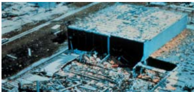
AV05085 – NOAA-National Weather Service- National Hurricane Center.

No construction technique is completely safe from the worst that nature can deliver, but silicone sealants offer today's advanced impact-resistant window systems the strength and flexibility to dramatically increase personal safety and minimize damage in the future.